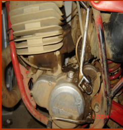
1983 Maico 490 Engine

"I welcome anyone who wishes to contribute email me at motors@opferman.com with their Maico Stories"