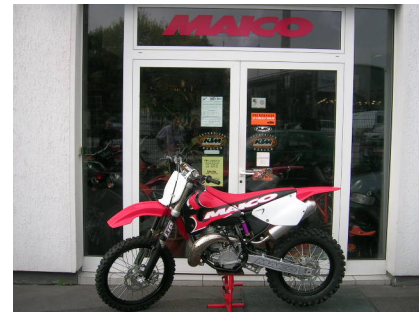
2009 Maico 685 Cross

You can also visit Kostler Maico's website at http://maico-bikeworld.de