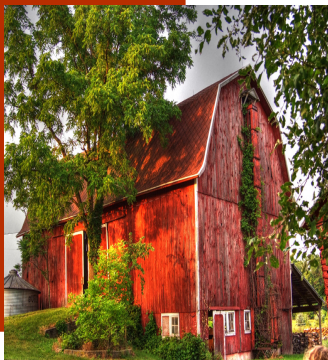
Historic barn in Michigan

Keep on the lookout for those barn finds. Several of them have been found recently and some have been going on sale but for a Maico barn find they are usually a