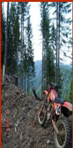
1983 Maico 490