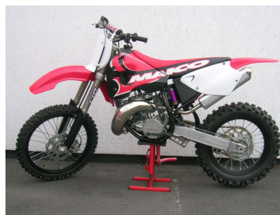
2008 Maico 250 Cross

You can also visit Kostler Maico's website at http://maico-bikeworld.de