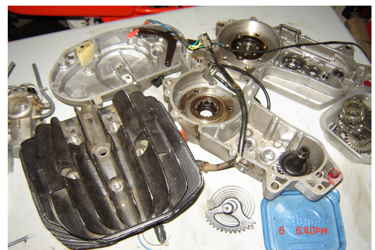
Pieces of my 1982 Maico 490 GS

letters as well. Send in your rebuild story or a brief description with some before and after pictures I can feature them here!